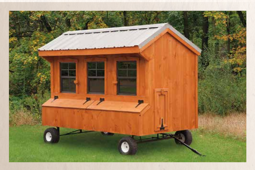
4 x 8 Quaker • Model Q48 Shown with cedar stain and grey metal roof 14–16 Chickens