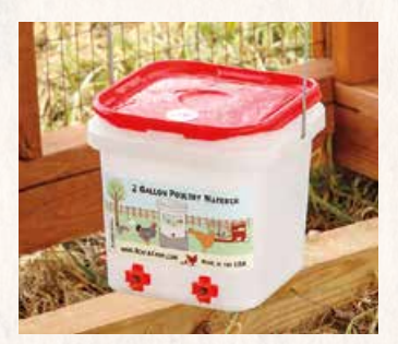
2 Gallon poultry waterer