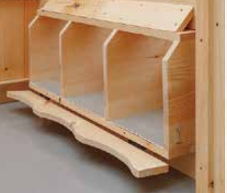
Easy clean out next boxes A-frame style standard