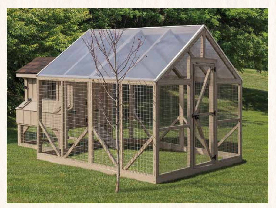
3 x 4 Quaker Model Q34

8 x 8 Run Polycarbonate Roof Shown with buckskin paint and autumn brown shingles 4–6 Chickens