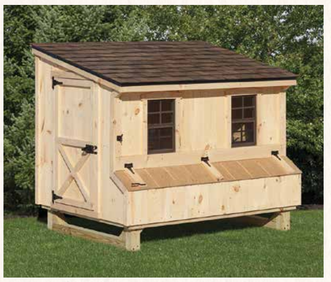
4 x 6 Lean-to Style • Model LT46 Shown unfinished with autumn brown shingles 10–12 Chickens