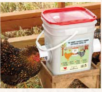
No waste chicken feeder 20 pound capacity