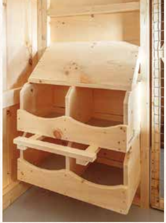
Nest boxes on feed room wall