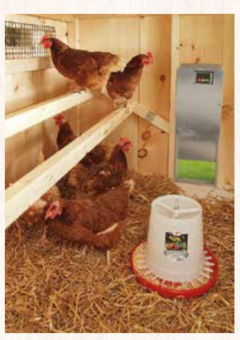
Automatic chicken door