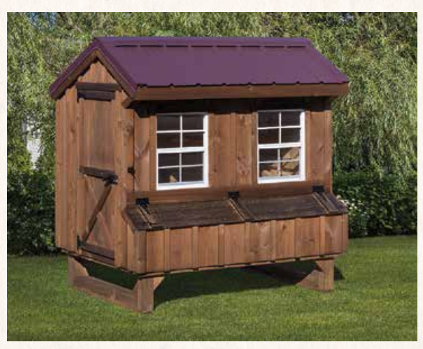
4 x 6 Quaker • Model Q46 Shown with mushroom stain and burgundy metal roof 10–12 Chickens