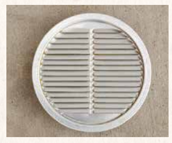
4" Gable vent