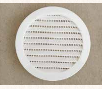
6" Gable vent