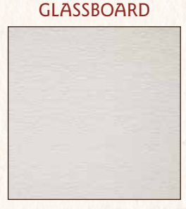
Protect floors with washable glassboard for easy coop cleaning