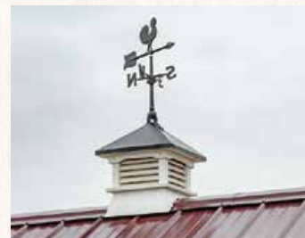
Cupola with weathervane