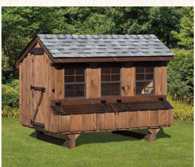
5 x 8 Quaker • Model 58AF Shown with mushroom stain and silver grey shingles 20–22 Chickens