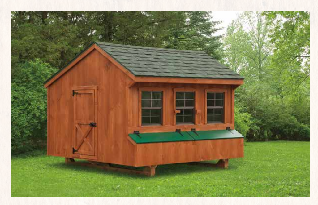
8 x 8 Quaker • Model Q88 Shown with rustic cedar stain and boreal green shingles 30–32 Chickens