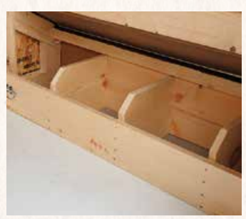
Easy clean nest boxes Quaker style standard