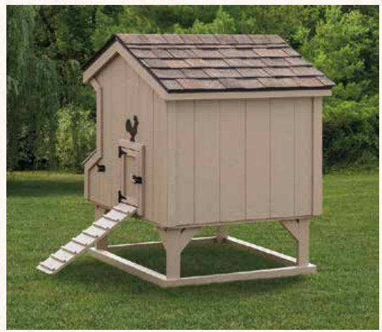
3 x 4 Quaker Model Q34 Shown with buckskin paint and autumn brown shingles