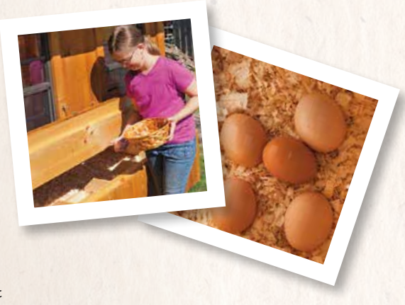
Pictured without the wheel kit